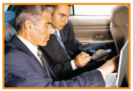
Take important calls while in traffic