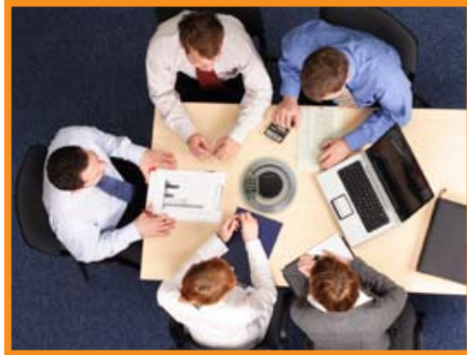
Crisp and clear so everyone can be heard