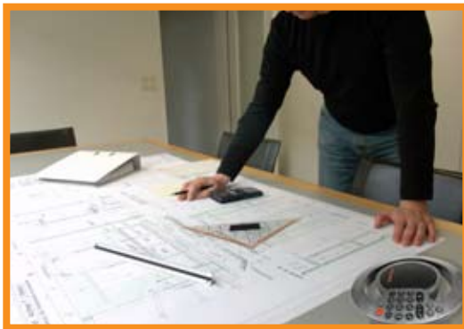
Volume & clarity for your office conference calls