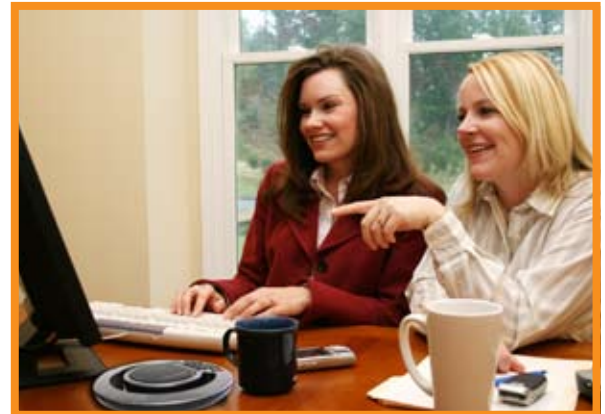
Big office sound at a small office price